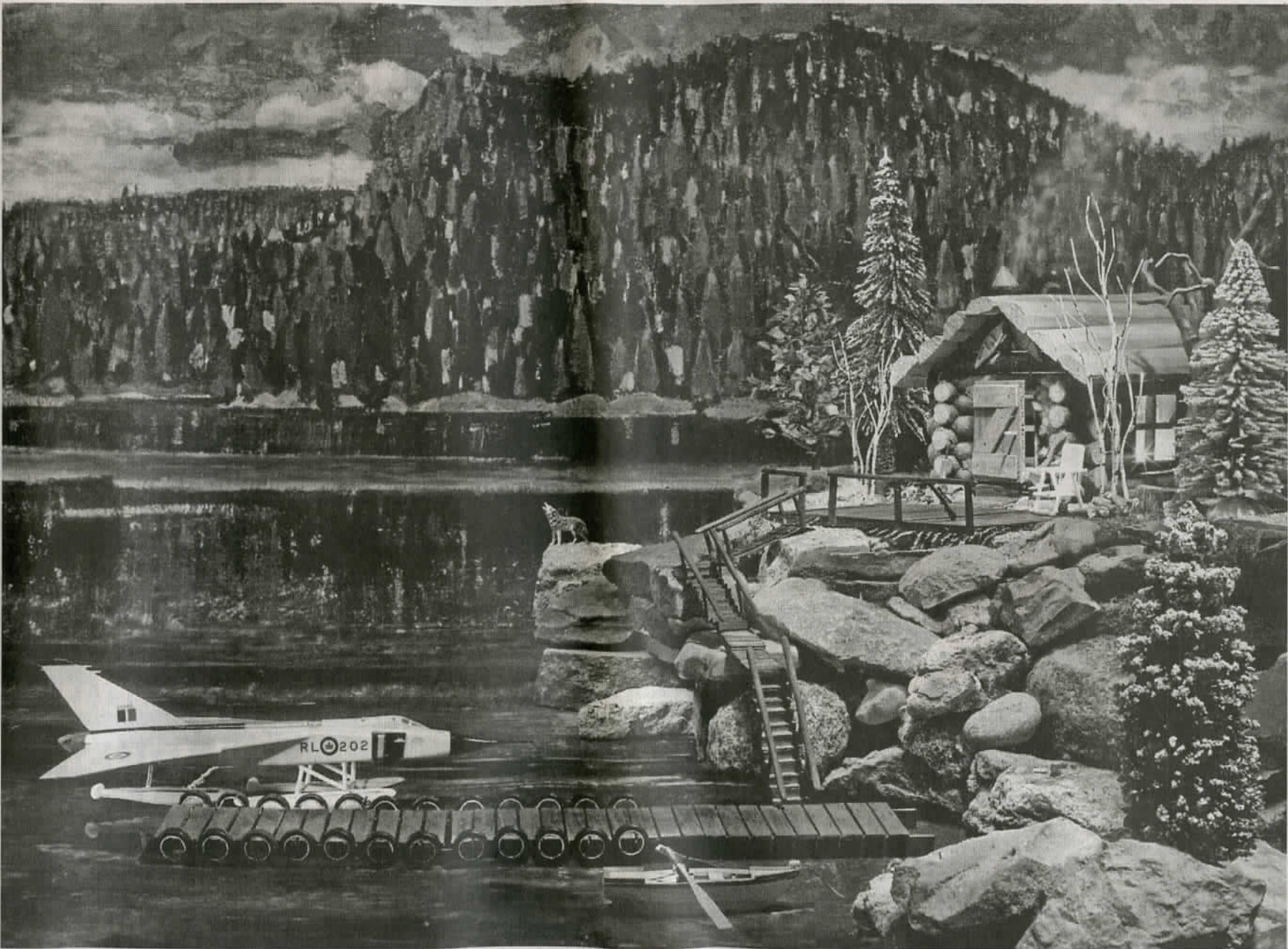
Above: Avro Arrow at Sombre Hill uses an Arthur Lismer backdrop; below: Early Snow with Bob and Doug places the dopey hosers in a Tom Thomson setting.